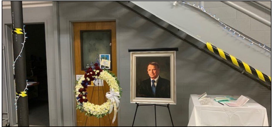
The Canby facility set up a memorial wreath and photo, along with a table for condolence messages.