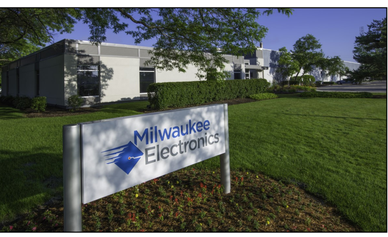
Milwaukee Electronics' Milwaukee facility offers customers in the Midwest the ability to keep production in close proximity to their teams.

Milwaukee Electronics recently won a box build project from an industrial customer for a IoT gateway product. The product involves assembling a printed circuit board assembly (PCBA) in a housing and final packaging. The units will be shipped to the customer's distribution warehouses. A preproduction order will be built in March and involves a PPAP level one process. Full production is expected to represent more than $1 million annually. The project will be built in the Milwaukee, WI facility.