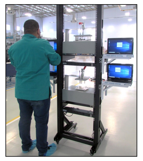
The redesign on this test unit quadrupled units under test and reduced the test station footprint from 72 sf to 6 sf.

One of Milwaukee Electronics' customers had a problem. Demand for their traffic camera products has been more than double their original forecast. As a result, the original functional test and burn-in setup had become a bottleneck