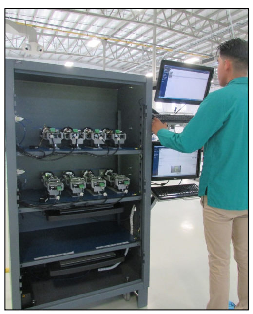
The redesigned burn-in cabinet can now test eight units simultaneously.

The team now plans to review functional test stations in other facilities to determine if the test strategy they have developed for this project can optimize other projects.