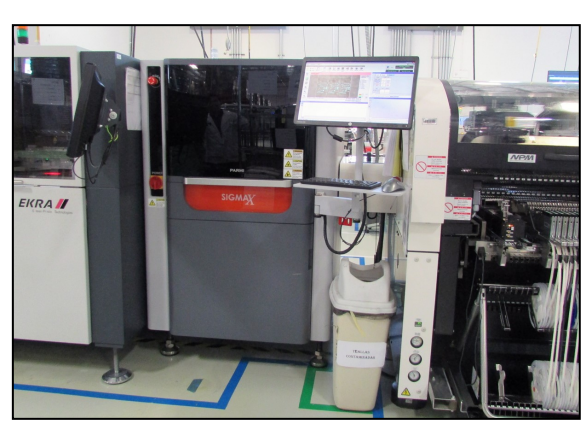
Above, an inline 3D solder paste inspection station.

ment was the best way to automate that process. At the same time, our automotive-related customer base is growing as well. The complexity of those SMT PCBAs re-