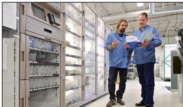
The compliance team is using industry-standard tools to assess cyber threats.

The Compliance team is also working to ensure Milwaukee Electronics stays abreast